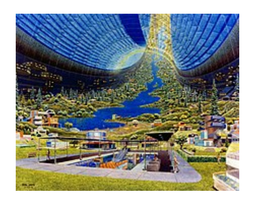
Project of an orbital colony <u>Stanford torus</u>, painted by Donald E. Davis

Futures studies or futurology is the science, art, and practice of postulating possible, probable, and preferable futures and the worldviews and myths that underlie them. Futures studies seek to understand what is likely to continue, what is likely to change, and what is novel. Part