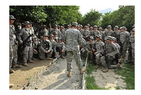
General Petraeus talks with U.S. soldiers serving in Afghanistan